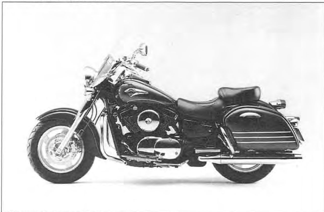
VN1500-G1 (Australia) Right Side View: